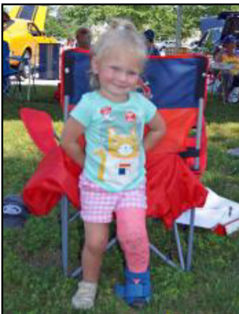
Future Ford Fan