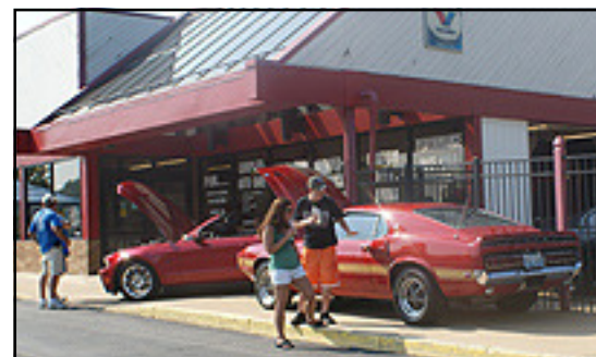
The Pur Performance facility is a great location in central St. Charles County. The store stayed open late for our event.

O ur club, along with the Show-Me Mustang club, held our all Ford Blue Cruise on July 9th. Although somewhat warm, there was a steady breeze and as the sun set, it turned into a beautiful evening.