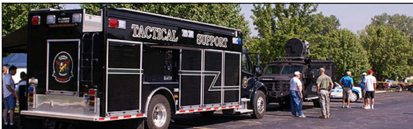
We were a little disappointed with the lack of police and fire vehicles in attendance but the St. Charles County Regional SWAT saved the day and did more than their part to supporting the cause.

Thanks go out to the Mustang Club of St. Louis for their great support of over 20 Mustang entries. Special thanks go out to Pur Performance for the use of their facility and to the members and families of both clubs for all of their work on this very worthwhile event.