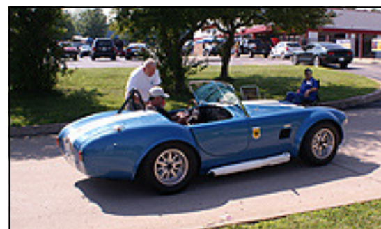
Each club took turns collecting donations as the Blue Oval crowd arrived. The event was really a low work event.

It was a “good news, bad news” kind of day. The bad news was that our car count was down from last year. The good news was that the crowd was quite generous. With outside donations, club donations, 50-50 profit, concessions, and participant donations, we were able to collect over $2,500 to be donated to The BackStoppers. The car clubs shouldered the expense of the DJ and concessions.